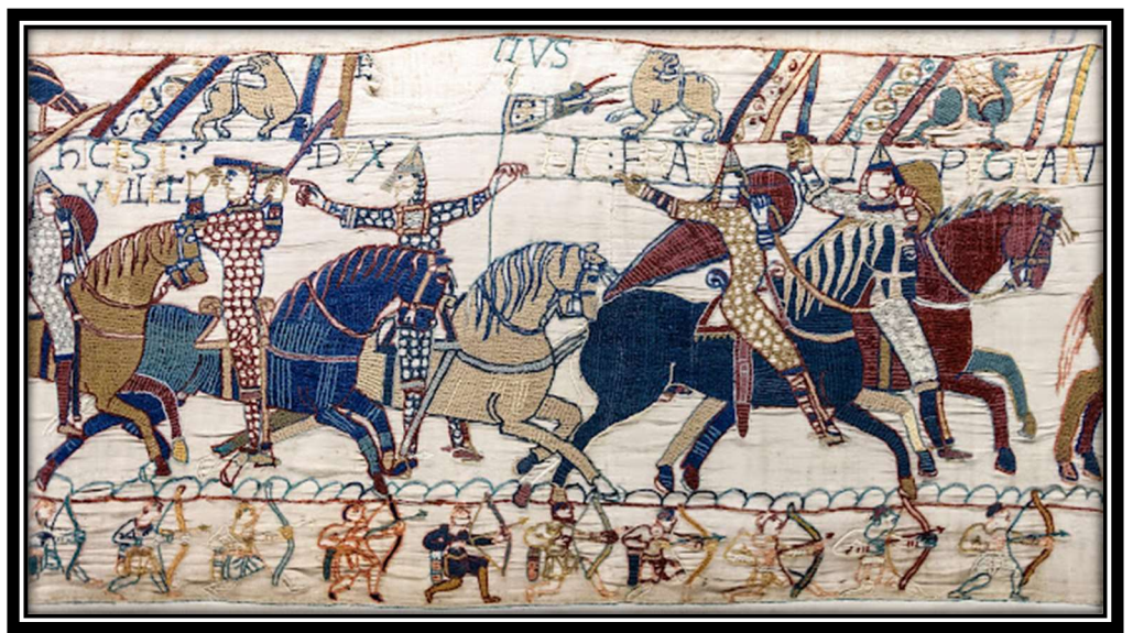
The Battle of Hastings (La bataille de Hastings, 1066), Scenes 55 & 56, Tapistry Museum (Musée de la Tapisserie), Bayeux.

12<sup>th</sup> to 15<sup>th</sup>, May 2024 Caen, Normandy, France